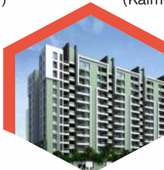
Venkatesh Habitats (Ajni)