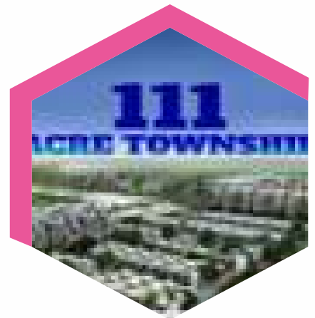
Vrindavan City Jamtha