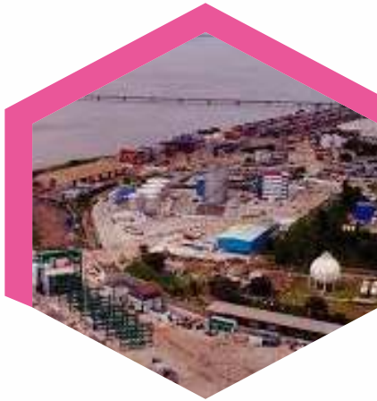
Afcons Infrastructure Pvt. Ltd.

Exploring Sajid Waterproofing Co.'s Diverse Waterproofing Portfolio