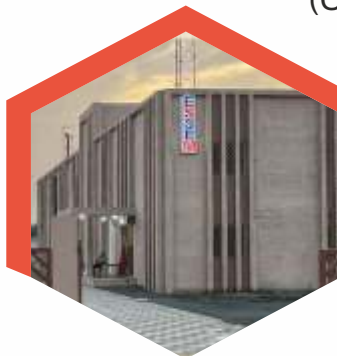
ESSEM Compliance (MIHAN)