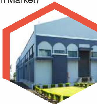
Bhagirath Textiles (Kalmeshwar)