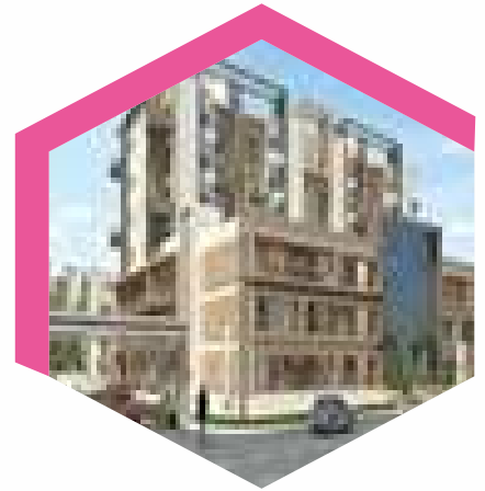
Madan Ratan City