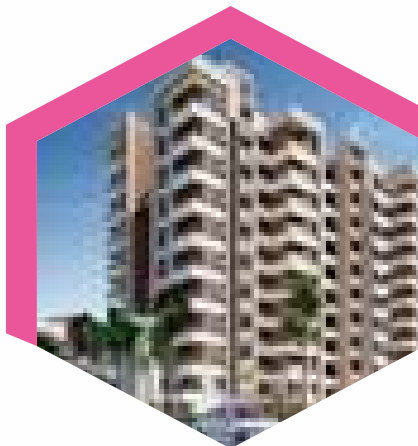
Singapore City Ghotal Panjari