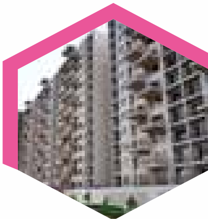
Prozone Palm Khapri