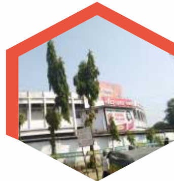
Baidyanath New Office (Ghat Road)