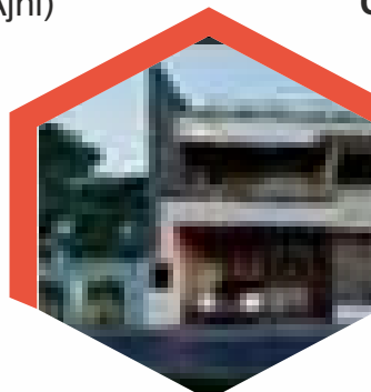
Bagde Residence (Shanti Nagar)