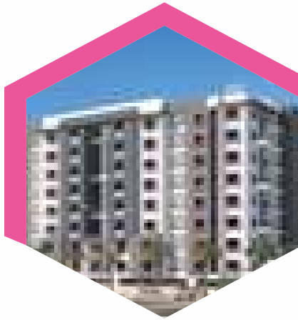
Ensaara Metro Parti Pipla